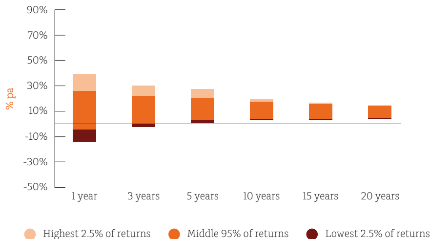
Ranges of returns for the Trust's benchmark asset allocation based on investment market returns from 1900 to 2018 (before fees)

The graph below shows how broad the ranges of investment market returns have been over more than 100 years. It illustrates that historically the longer the investment time period the narrower the range of returns.