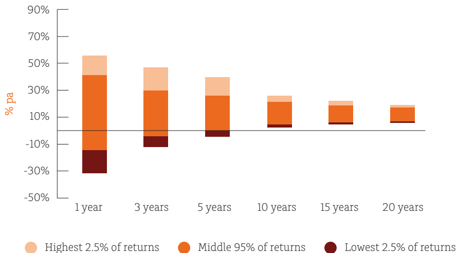
Ranges of returns for the Trust's benchmark asset allocation based on investment market returns from 1900 to 2018 (before fees)

The graph below shows how broad the ranges of investment market returns have been over more than 100 years. It illustrates that historically the longer the investment time period the narrower the range of returns.